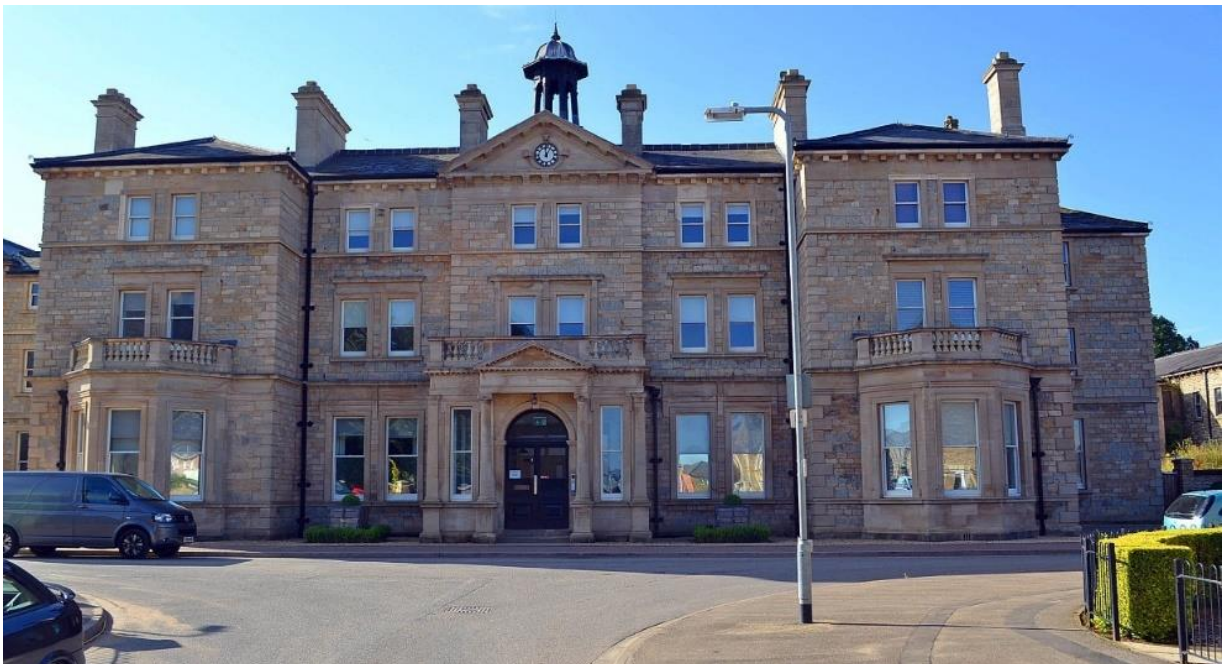
St John's Hospital entrance 2016 facing northwards towards Canwick Road (Asylum Lane)